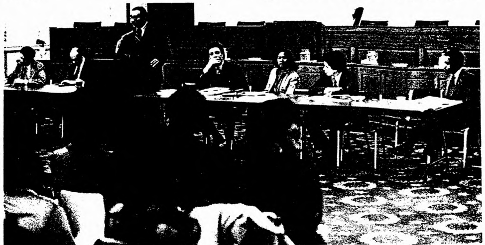
Participating in a special press briefing on the Legislative Agenda were, from left to right, Representatives William Clay, Louis Stokes, Charles Rangel, Ronald Dellums, Yvonne Burke, Harold Ford, Augustus Hawkins (not shown), and Walter Fauntroy.