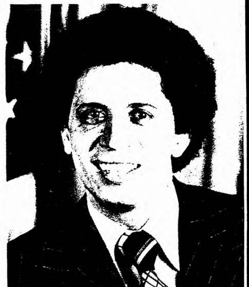
Representative Harold E. Ford

Congressman Ford, a vigorous consumer advocate, has introduced legislation that would require all packaged consumer commodities to be labeled to show their selling price. He is also concerned about jobs, the role of utilities and the development of economic in-